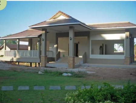
SeaRidge Club House Construction – May 7