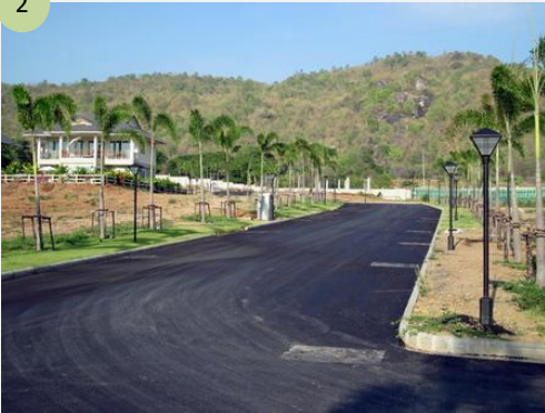
Completed Roads in Villa Zone – April 15