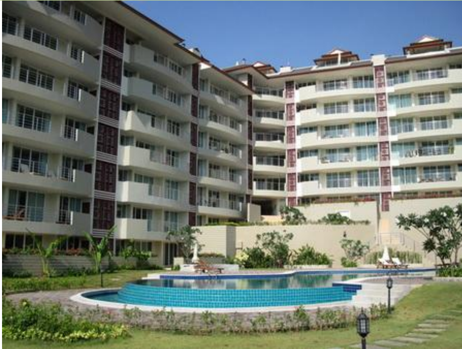
SeaRidge Condominium with Swimming Pool in Foreground