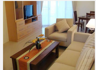
Spacious Fully Furnished Living Room