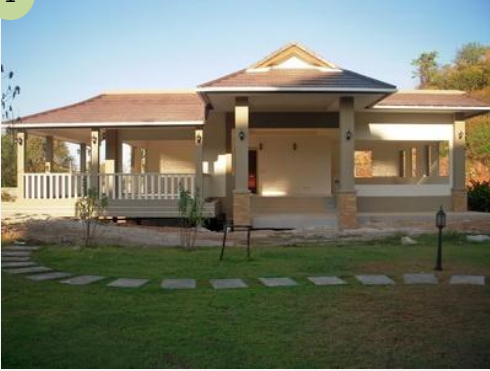
SeaRidge Club House Construction – May 7