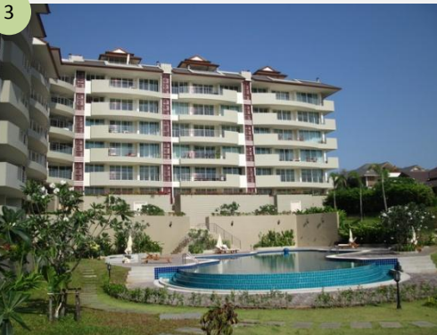
Condominium North Wing – April 15