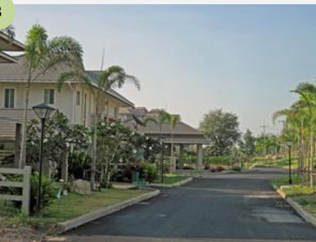
Completed Road in Villa Zone – April 15