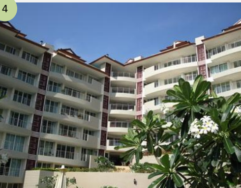
SeaRidge Condominium – April 15