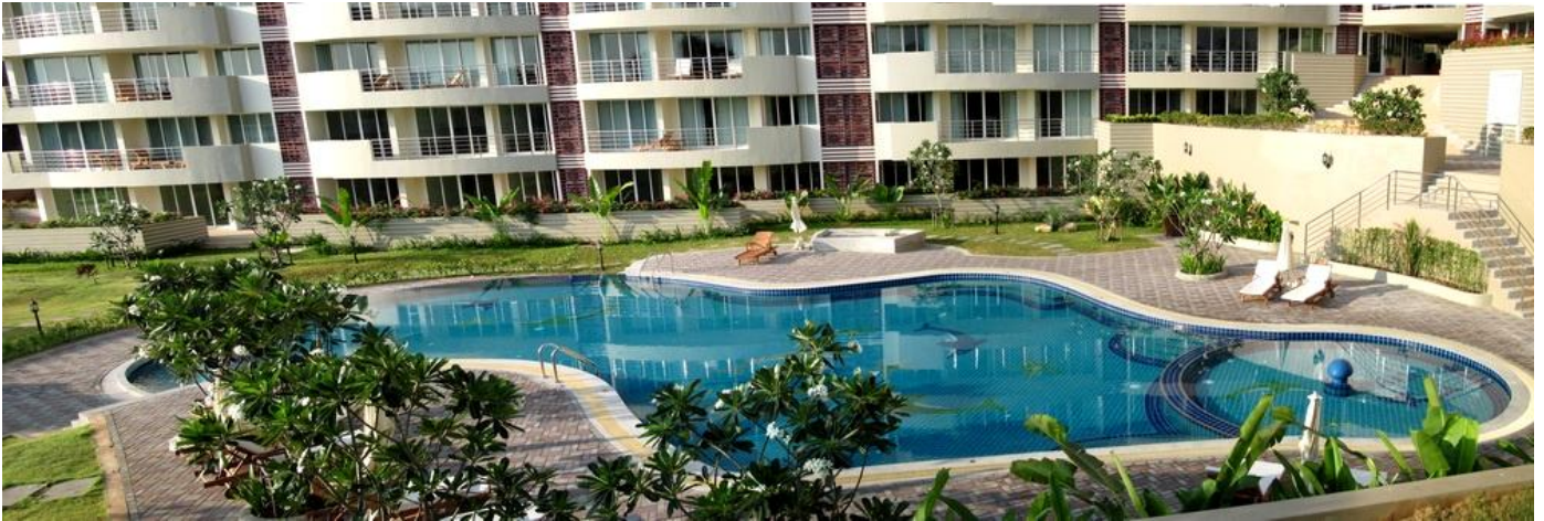
SeaRidge Condominium Swimming Pool – April 15