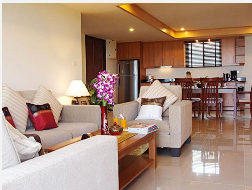
SeaRidge Vacation Rental – 3 Bedroom Luxury Condo