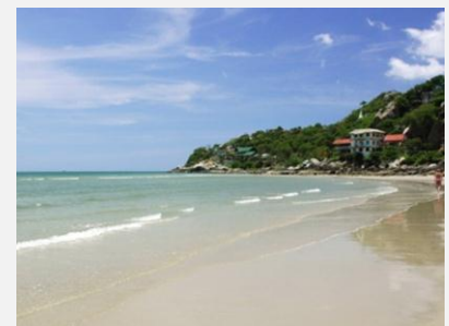
Khao Tao Beach

Suan Son Beach - South of Khao Takiab and just north of SeaRidge, this beach is named after the surrounding pine tree forest. This beach can sometimes be busy on weekends but is extremely quiet during weekdays.