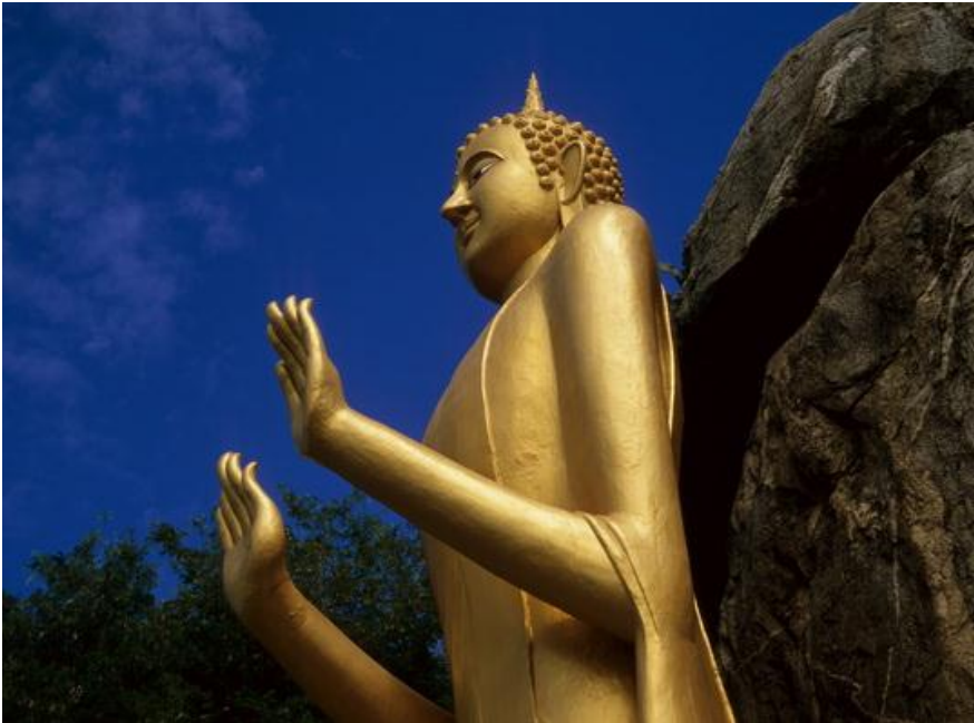
Buddah at Khao Takiab, Hua Hin