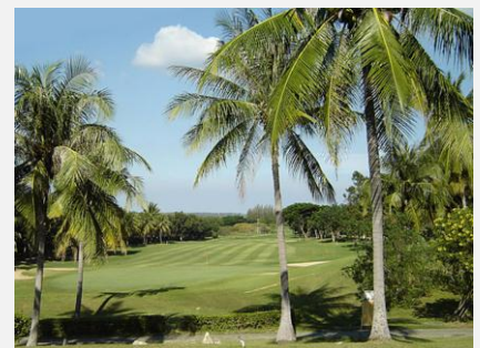
Palm Hills Golf Course

Whether you're looking for a locally designed course cut into the area's spectacular natural mountain terrain, a sea view links type course, or a championship Jack Nicklaus designed layout, Hua Hin has it all.