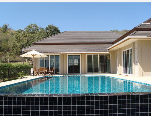
Crystal Pool Villa – 3 Bedroom Single Level Home