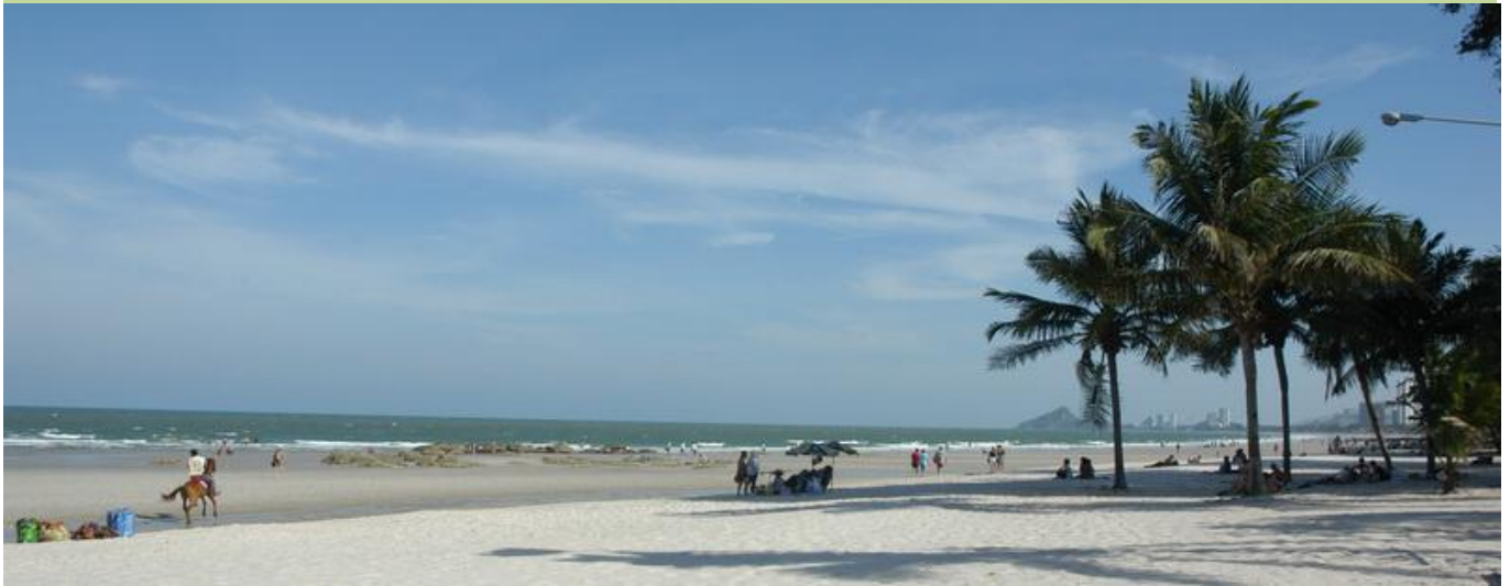
Hua Hin Beach