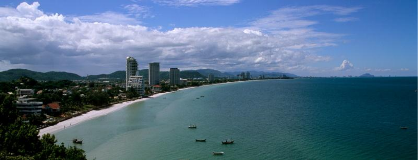
View of Hua Hin from Khao Takiab