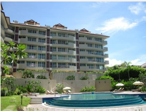
SeaRidge Condominium with Swimming Pool