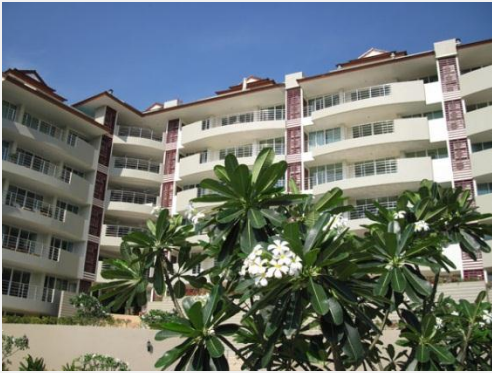
SeaRidge Condominium – Ready to Move in Now