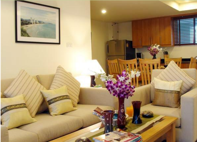
SeaRidge Palmyra Condominium