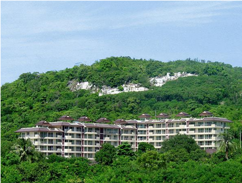
SeaRidge Condominium – Surrounded by Nature with Sea and Mountain Views