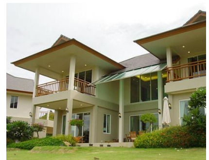
Crescent Villa – Floor Plan Can Be Modified to Meet Individual Tastes