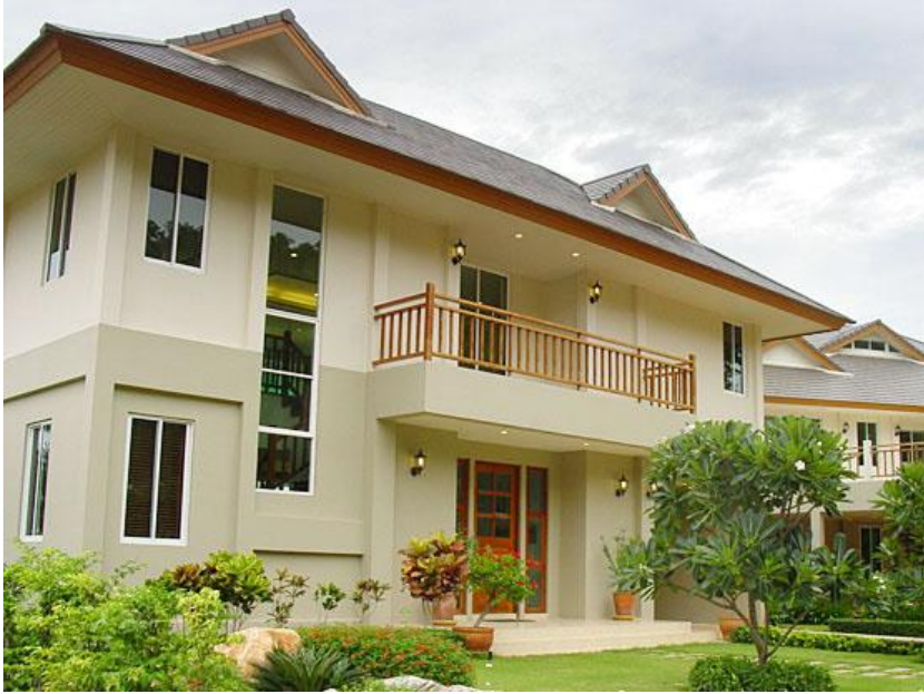
Crescent Villa – 3 Bedrooms & 4 Bathrooms