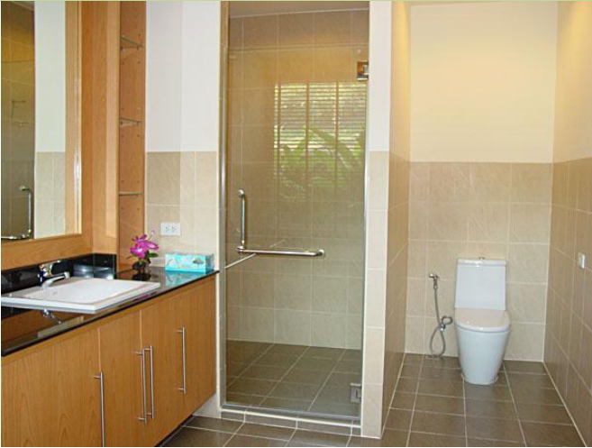
Jasmine Condo Bathroom