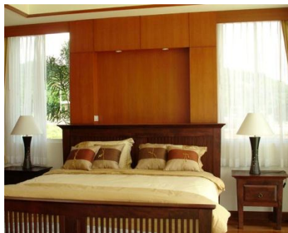
Furniture Package with Beautiful Built-In Teak Woodwork