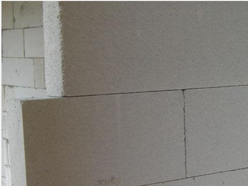
SeaRidge Uses Only High Quality Concrete Block

Contact us to find out more about our quality materials to go into every SeaRidge home.