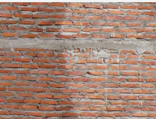
Low Quality Red Brick Construction